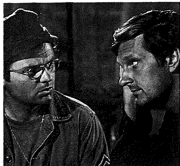
Hawkeye (Alan Alda) and Radar (Gary Burghoff) see eye-to-eye. Scene from the television show M*A*S*H .

“In an ironic version of the Cinderella plot, the hero and heroine would not be rewarded at the end with happiness ever after . . . and if Cinderella said she saw a fairy godmother, she'd probably be admitted to the hospital for psychiatric tests.”